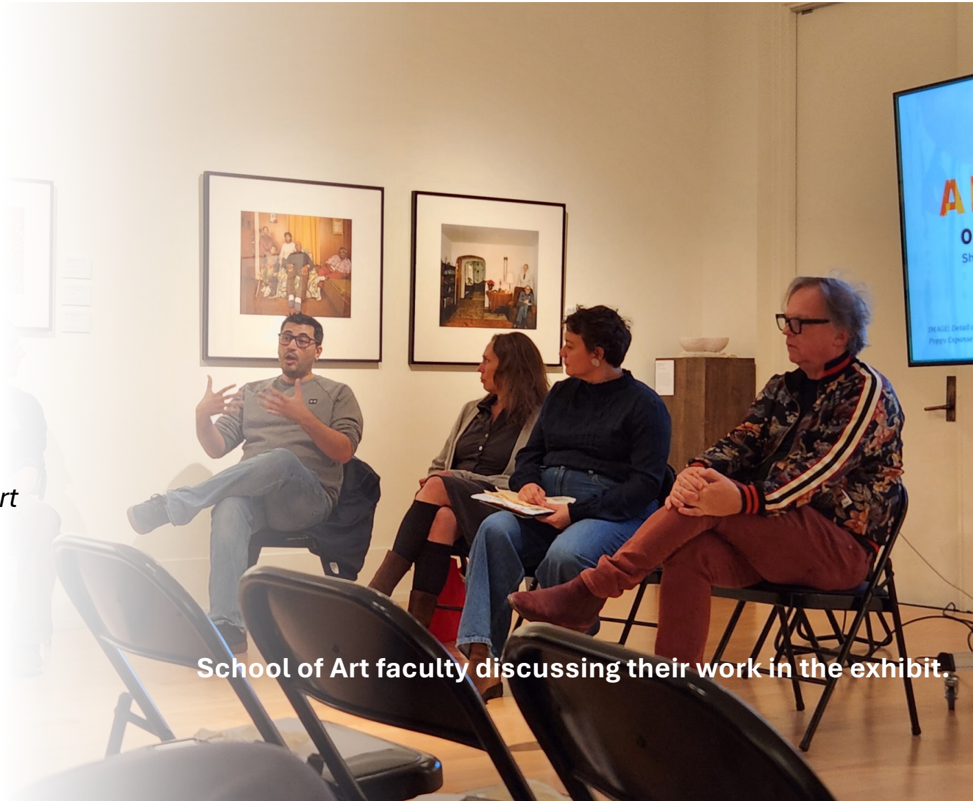
School of Art faculty discussing their work in the exhibit.